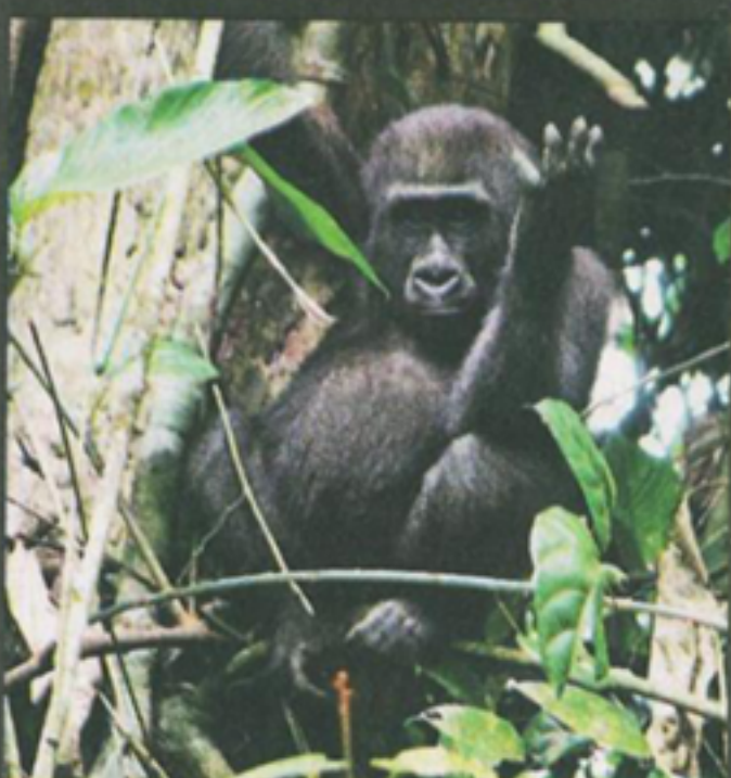
CLOCKWISE FROM TOP LEFT Dedon Island Resort in Siargao, the Philippines; Basque style in Getaria, Spain; Goddess of Mercy Temple, Koh Phangan, Thailand; Red Mountain Ski Resort, British Columbia; Groot Constantia, near Cape Town, South Africa; Mihrimah Sultan Mosque in Istanbul (left); gorilla in Odzala-Kokoua National Park in the Republic of Congo; the village of Stari Grad on Hvar, Croatia; Ipanema Beach, Rio de Janeiro; Indian Accent restaurant in New Delhi.